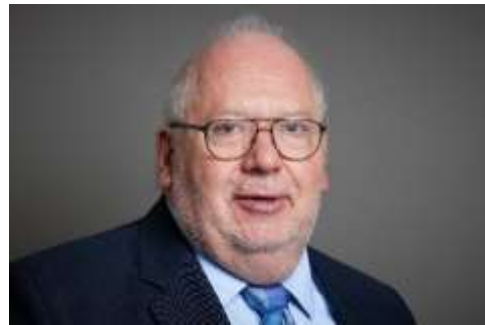
Lord Toby Harris

In May 2016, Sadiq Khan, then newly elected as Mayor of London, asked me to undertake an independent review into the city's preparedness to respond to a major terrorist incident. This followed the series of murderous terrorist attacks, involving firearms and bombs, across Western Europe in the previous year – notably those in Paris on Friday 13 th November which killed 130 innocent people including 90 at the Bataclan Theatre. My review, however, looked at a range of possible attack scenarios, including vehicles used as a weapon (as in the attack in Nice in July 2016 which killed 86 people).