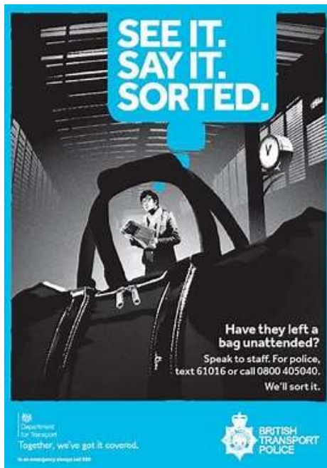
Figure 18: 'See It. Say it. Sorted.' and 'Run, Hide, Tell'.

'See It. Say It. Sorted.' aims to prevent a terrorist attack taking place. A nationwide campaign, it launched in 2016 to encourage train passengers (including on the London Underground) and station visitors to report unusual items and behaviour.