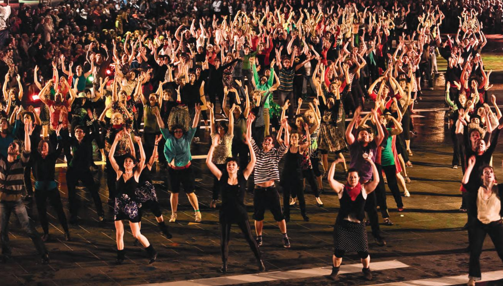
Le Grand continental, Festival Transamériques

and theatre halls – and the Place des Festivals, a key public space to host the city’s major festivals. The City has also created the Réseau Accès Culture, a network of 24 municipal cultural venues spread across all of Montréal’s 19 districts, to promote cultural outreach.