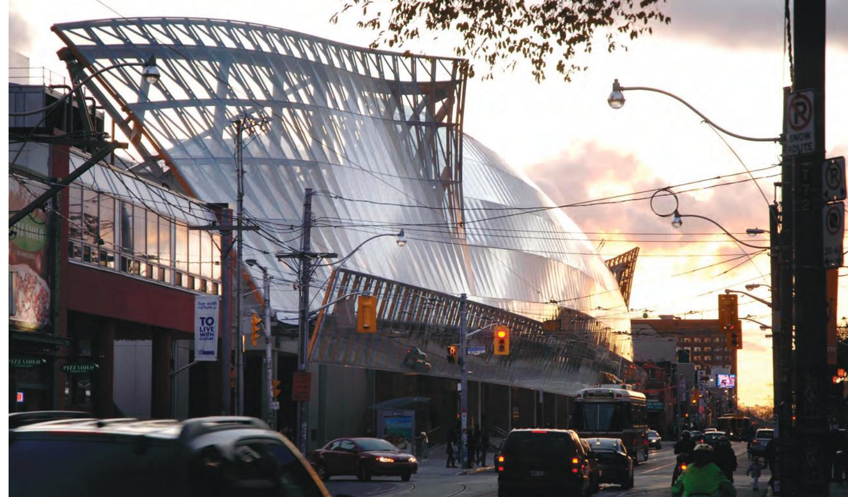
Art Gallery of Ontario (AGO)

While Canada has escaped the worst of the global economic problems of recent years, its authorities still have to operate in a climate of fiscal restraint. The City of Toronto is no exception, and in the cultural field it is exploring ways to boost non-conventional funding from the private sector and other levels of