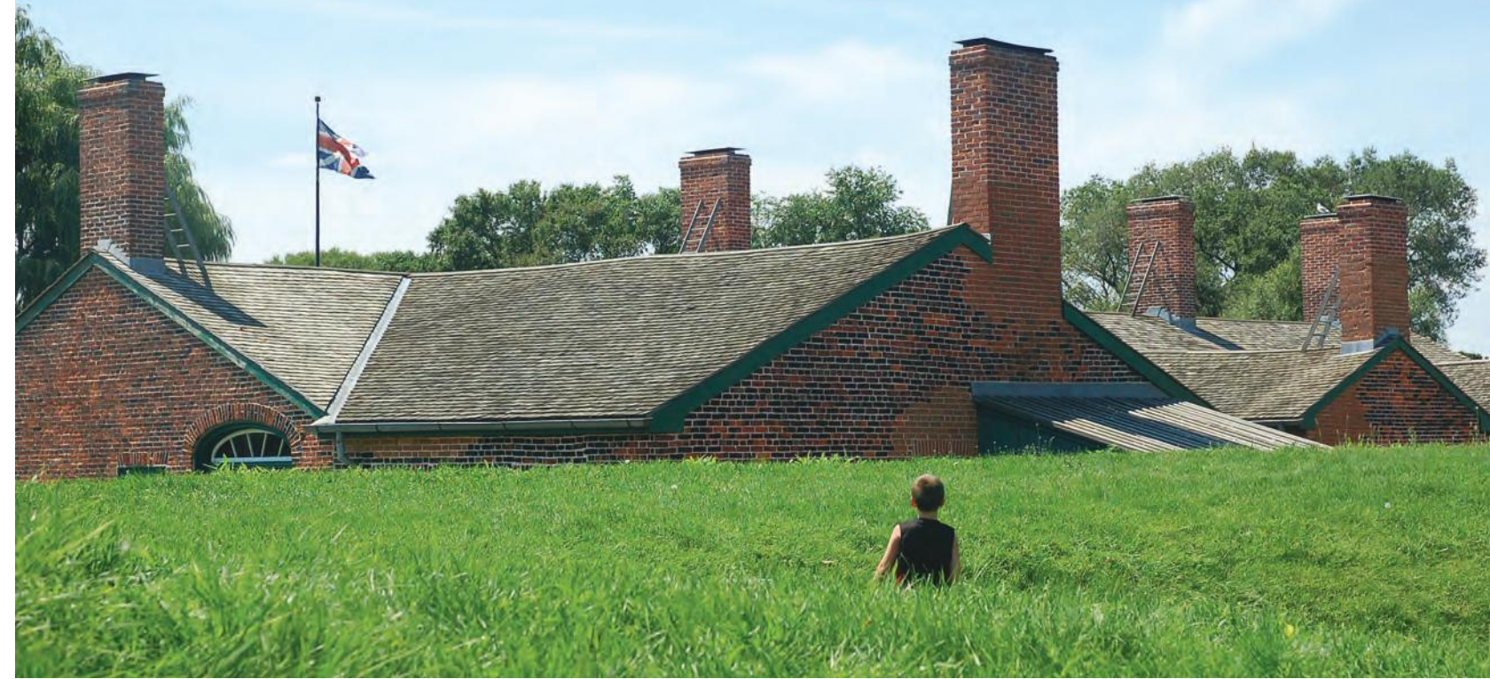
Fort York, Toronto

Toronto is a hugely diverse city: for example, almost half its population is foreign-born. Ensuring that this diversity is reflected in both the production and consumption of culture has become an important goal of cultural policy in the city.