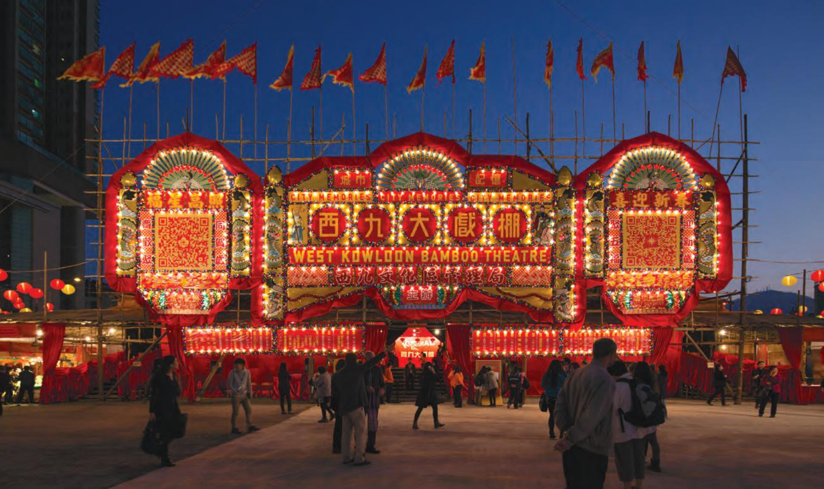
West Kowloon Bamboo Theatre, Hong Kong

controversies about the proposed design, but when complete it will feature M+, a museum focusing on 20th and 21st century visual culture; venues of varying sizes and configurations for both Chinese and Western performing arts, and ample green space. The District will have significant amounts of space dedicated to rehearsal, administration and arts education. There will also be retail, hotel and residential development around the venues to try and ensure it becomes a vibrant part of town.