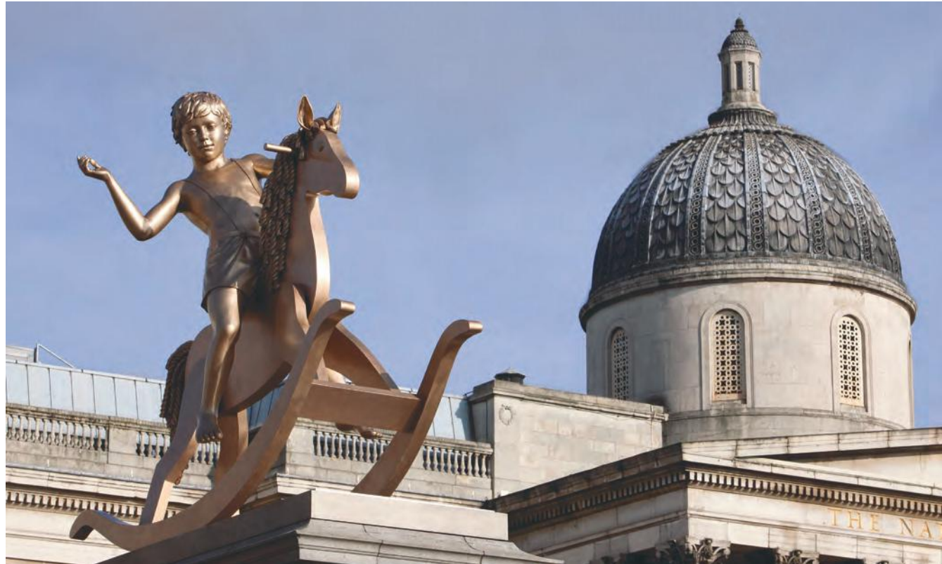
Powerless Structures, Fig.101 2012 by Elmgreen and Dragset, for the Mayor of London's Fourth Plinth Programme

2012 Festival, a ten-week cultural celebration of culture across the city. The festival acted both as a showcase for London talent and as an opportunity to bring many international artists to the city. The Games have also left a significant cultural legacy, notably the Queen Elizabeth Olympic Park, one of the largest new urban parks in Europe for many years and now a major new venue for events and festivals, and Anish Kapoor's major new sculpture, the ArcelorMittal Orbit at the centre of the Olympic Park, which has the potential to become a new visitor attraction.