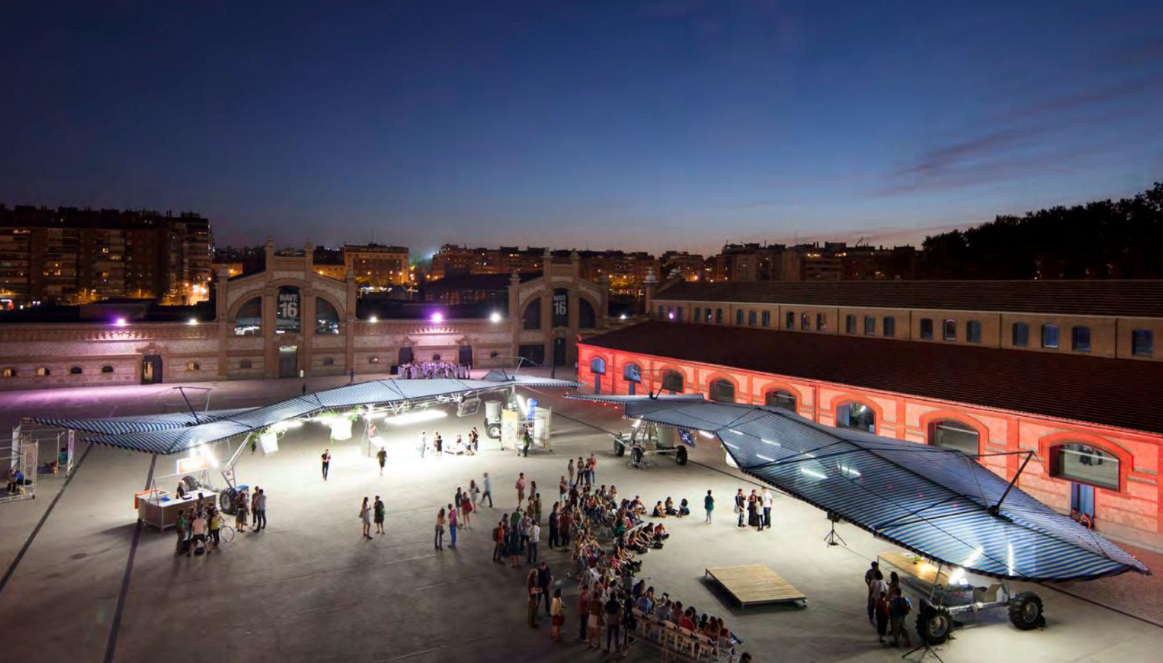
Matadero Madrid

resources, as it recognises that the ways culture is produced, consumed and shared nowadays is changing: audiences want to take a more active role, enabled by new technologies. In this line of action, the Madrid City Council launched in 2007 the Centre for Contemporary Creation Matadero Madrid, a multidisciplinary cultural space whose management model is based on public-private cooperation, promoting the participation of society and thus ensuring its plurality, independence and viability.