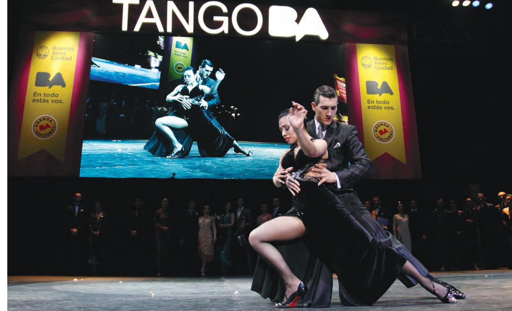
Tango Buenos Aires, Festival & Dance World Cup

One result of these innovative policies has been the creation of the Design Metropolitan Centre (CMD), as part of the wider Design District Project. This former fish market located in an economically deprived area was turned into a design hub aimed at providing business incubation, training courses for enterprises and residency programmes. As well as an auditorium,