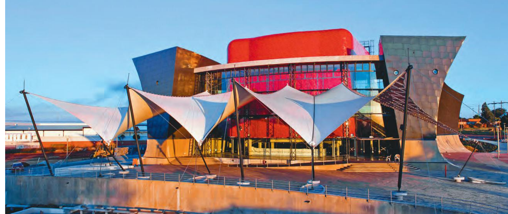
Soweto Theatre, Johannesburg

Much attention has been given to research and policymaking in Johannesburg and Gauteng over the last decade. One of the results of this has been an ambitious and ongoing programme of public art development in the Johannesburg Metro based on a percent for art model. Another area that has received major attention is creative and cultural