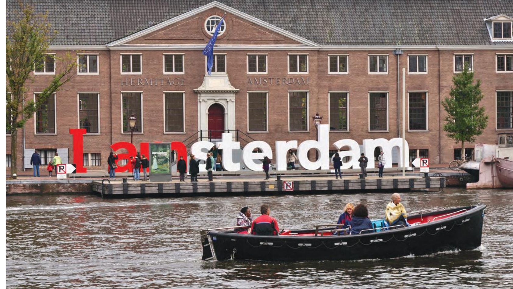
opposite: Hermitage Amsterdam

The cultural sector in The Netherlands is coming under pressure as cuts are made to government subsidies in response to the country's economic difficulties. Amsterdam is responding to this by trying to instigate new thinking in its cultural institutions. Amsterdam's Plan for the Arts (published every four years by the Arts and Culture team of the Amsterdam