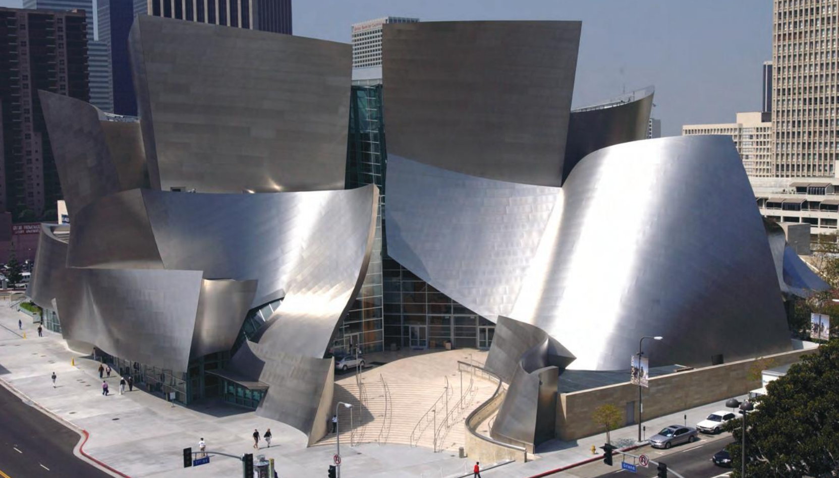
Walt Disney Concert Hall

which 60 institutions and 75 galleries co-operated to put on simultaneous exhibitions and performances showcasing the work of more than 1,300 artists. A similar series of programmes, lasting ten weeks and involving 120 organisations, was built around LA's first production of Wagner's full Ring cycle in 2010.